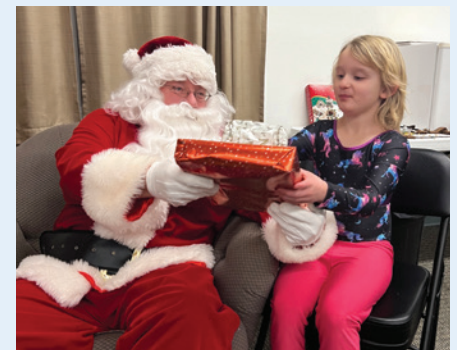
TO SEE MORE residential holiday photos, use this QR code: